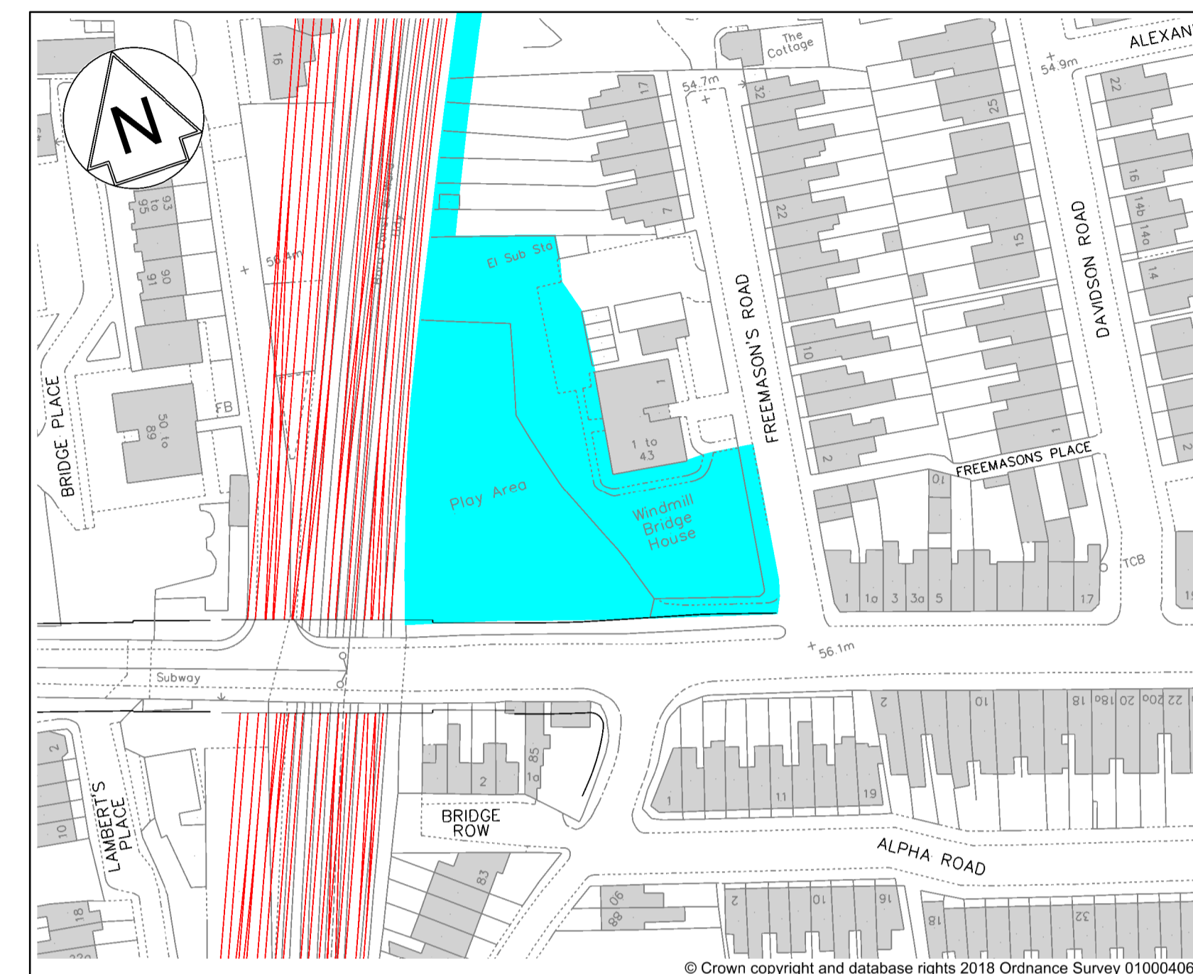
Lower Addiscombe Road/Windmill Bridge Playground Area - Proposed Construction Phase Layout